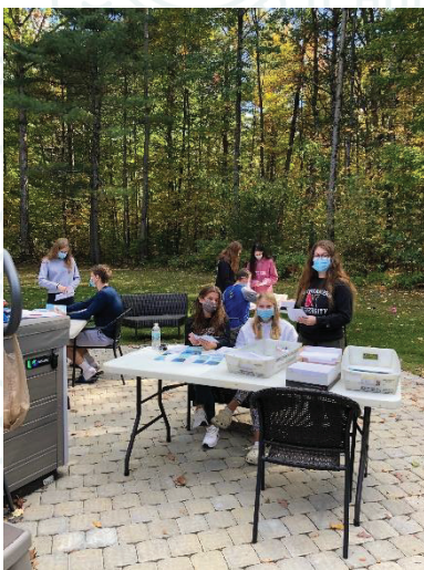
2020 Phone-A-Thon Participants

Through our fundraising, QCSA provides awards to students who best reflect the characteristics and criteria of our varied scholarships. These can include student activities, community service, character, academic merit and need.