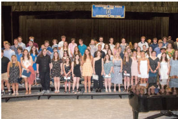
2022 Awards Ceremony

Through our fundraising, QCSA provides awards to students who best reflect the characteristics and criteria of our varied scholarships. These can include student activities, community service, character, academic merit and need.